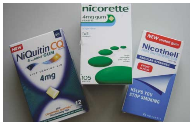
Nicotine gum products